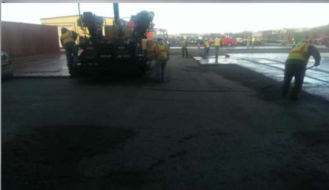
Forum Energy RCC JV- GOH and Centre Concrete