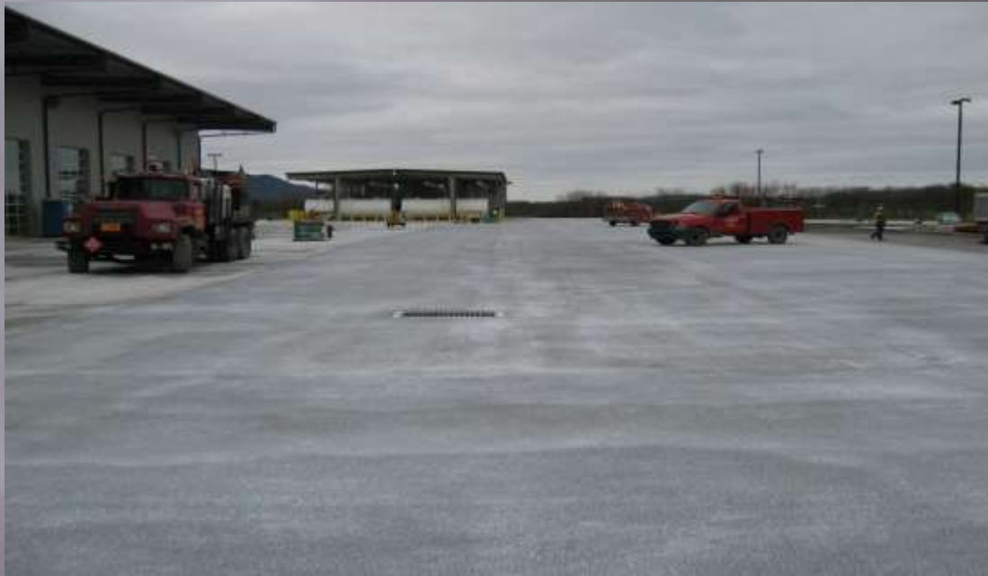
Baker Hughes RCC JV - GOH and Centre Concrete