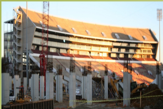
Davis Wade Stadium, Starkville, Mississippi