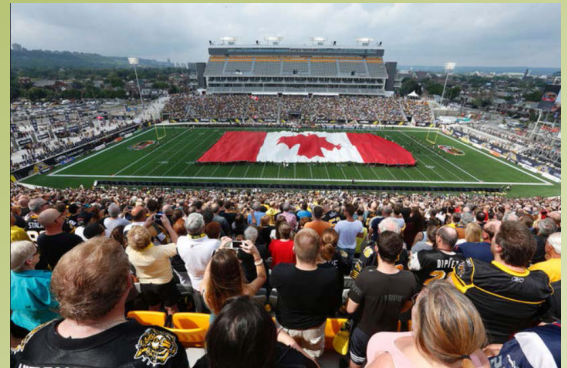
Tim Horton's Field, Hamilton, Ontario